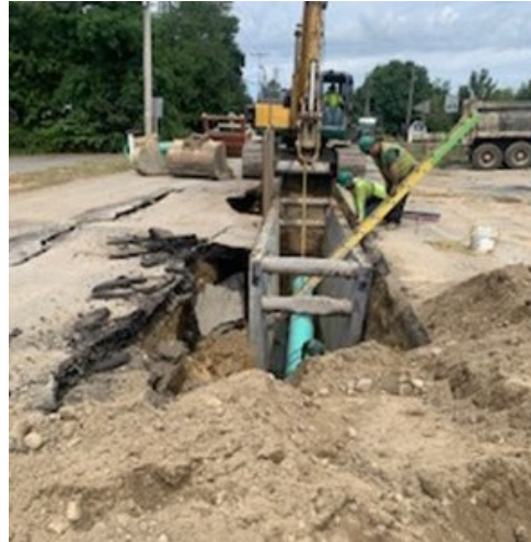
Photo 1: Installation of 20-inch PVC Sewer Force Main on Auburn Street