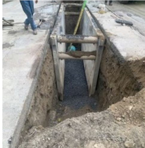
Photo 1: Installation of 20-inch PVC Sewer Force Main on Auburn Street