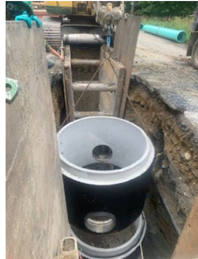
Photo 3: Installation of 6-foot Cleanout Sewer Manhole on Auburn Street