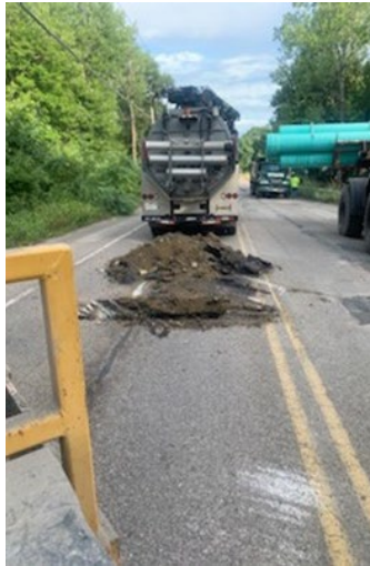
Photo 2: Vac Truck Locating 20-Inch Sewer Force Main and 24-Inch Brockton Water Main