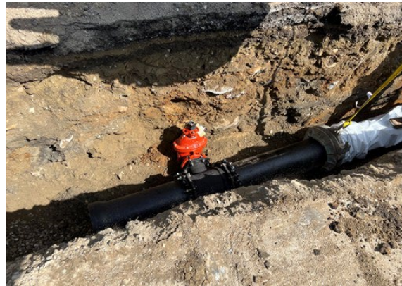
Photo 3: Installation of a 6-inch Water Main Gate Valve on Auburn Street