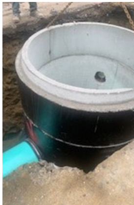
Photo 2: Installation of the 6' Air Release Manhole on Auburn Street