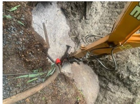
Photo 3: Exploratory Test Pit in Cross-Country Easement to Locate Existing Utilities