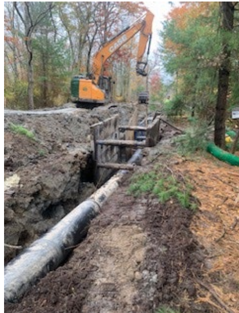
Photo 3: New Sewer Force Main Installation in Cross-Country Easement