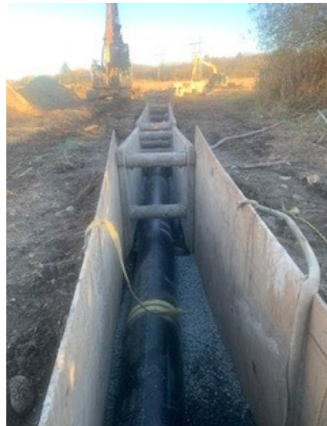
Photo 3: Installation of New 20-Inch Sewer Force Main in Cross-Country Easement