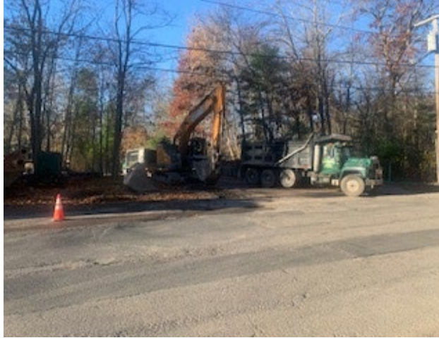
Photo 1: Start of Meter Pit Installation in Cross-Country Easement off Auburn Street