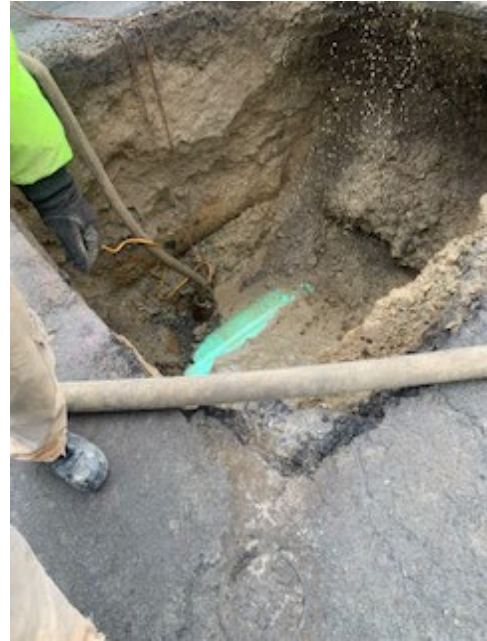
Photo 2: Excavation for Force Main Connection at Auburn Street East PS